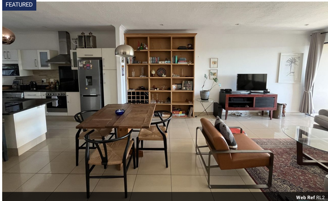
Web Ref RL2