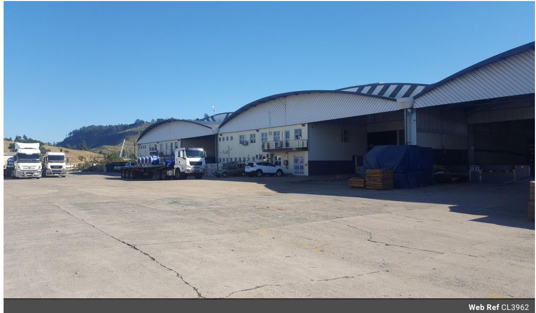
Web Ref CL3962

Block C Bellevue Campus 5 Bellevue Road Kloof