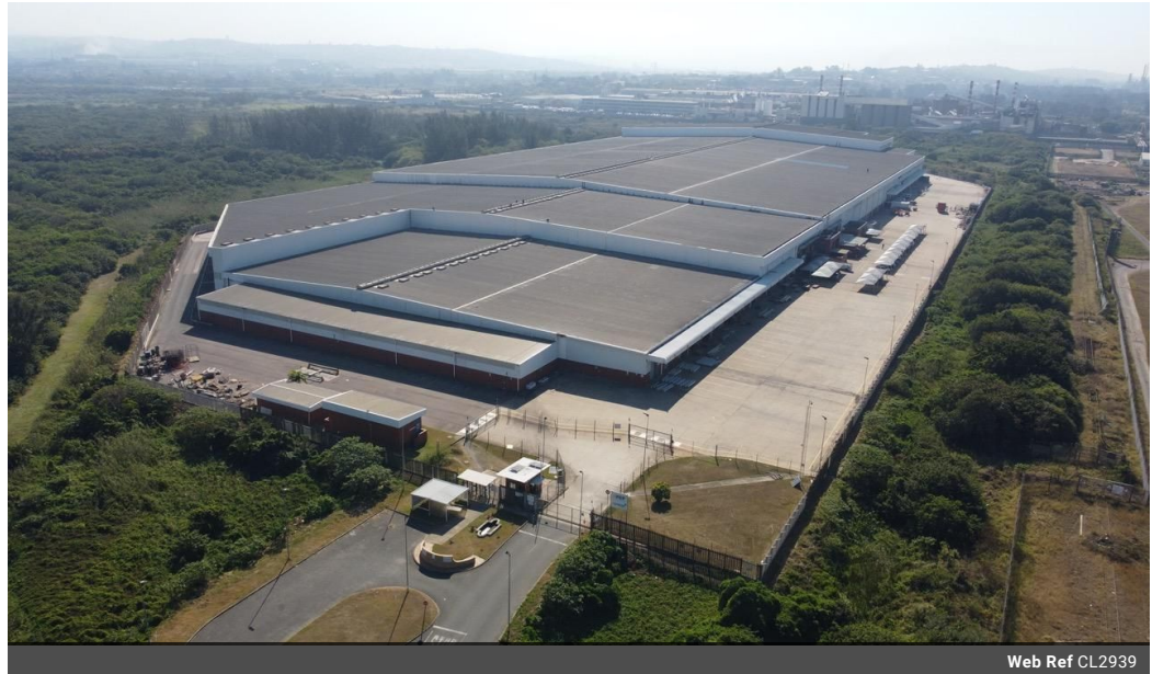
Web Ref CL2939

Block C Bellevue Campus 5 Bellevue Road Kloof