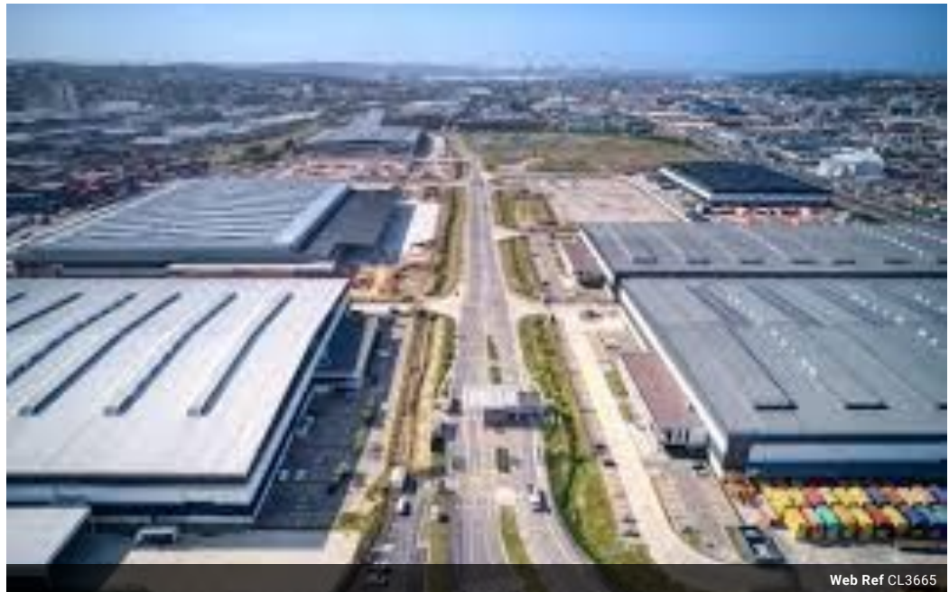
Web Ref CL3665

Block C Bellevue Campus 5 Bellevue Road Kloof