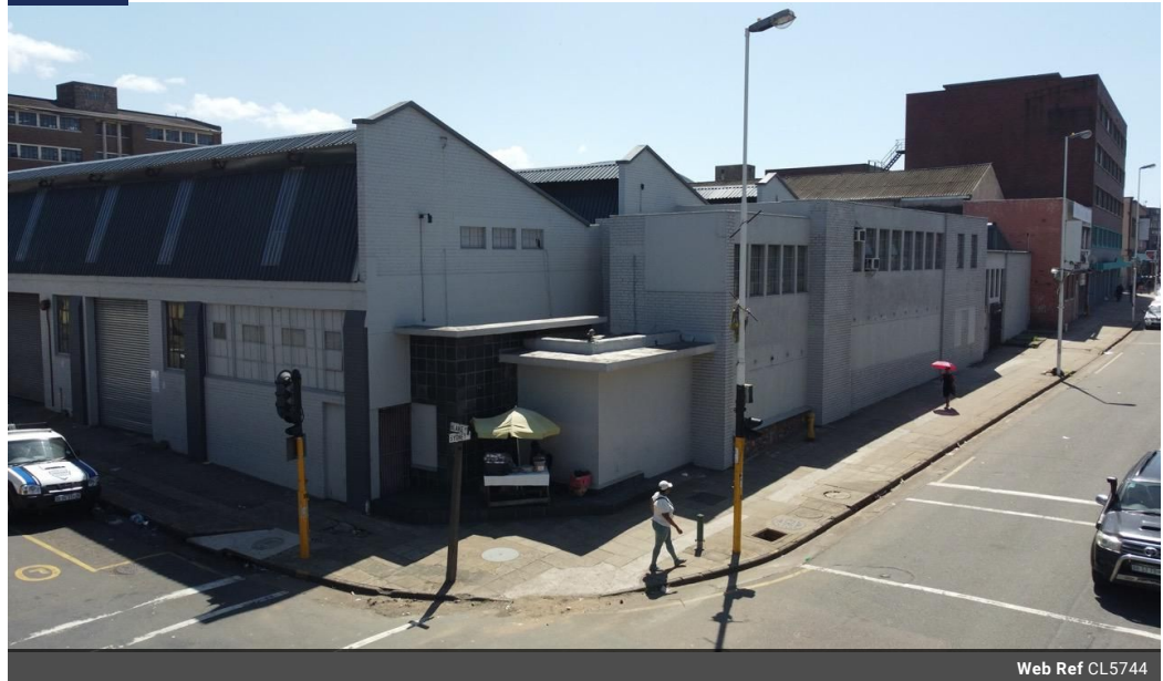
Web Ref CL5744