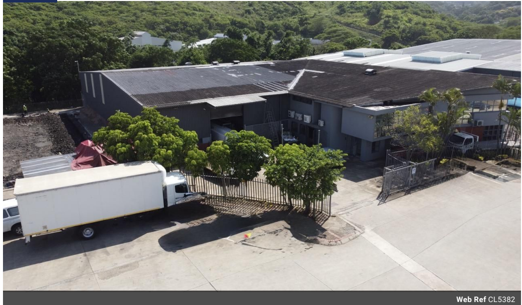
Web Ref CL5382