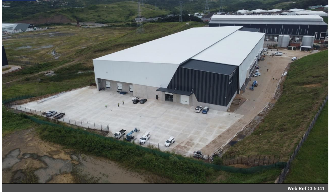
Web Ref CL6041