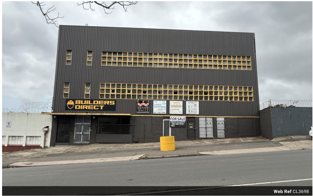
Web Ref CL3698

Block C Bellevue Campus 5 Bellevue Road Kloof