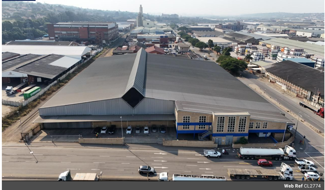
Web Ref CL2774