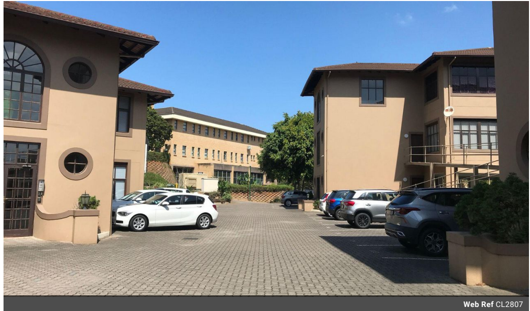
Web Ref CL2807

Block C Bellevue Campus 5 Bellevue Road Kloof