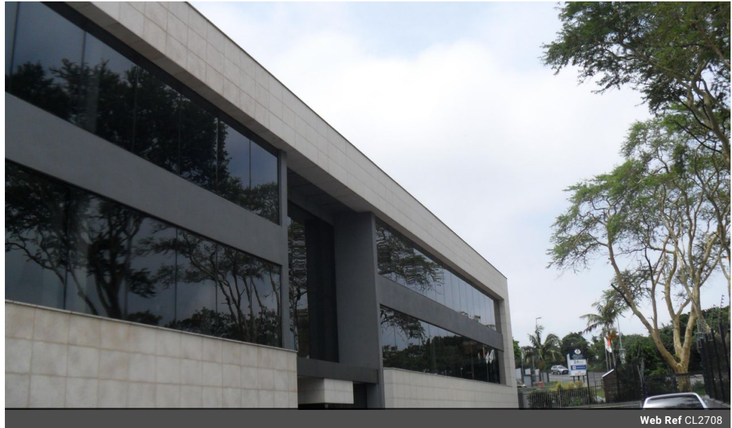
Web Ref CL2708

Block C Bellevue Campus 5 Bellevue Road Kloof