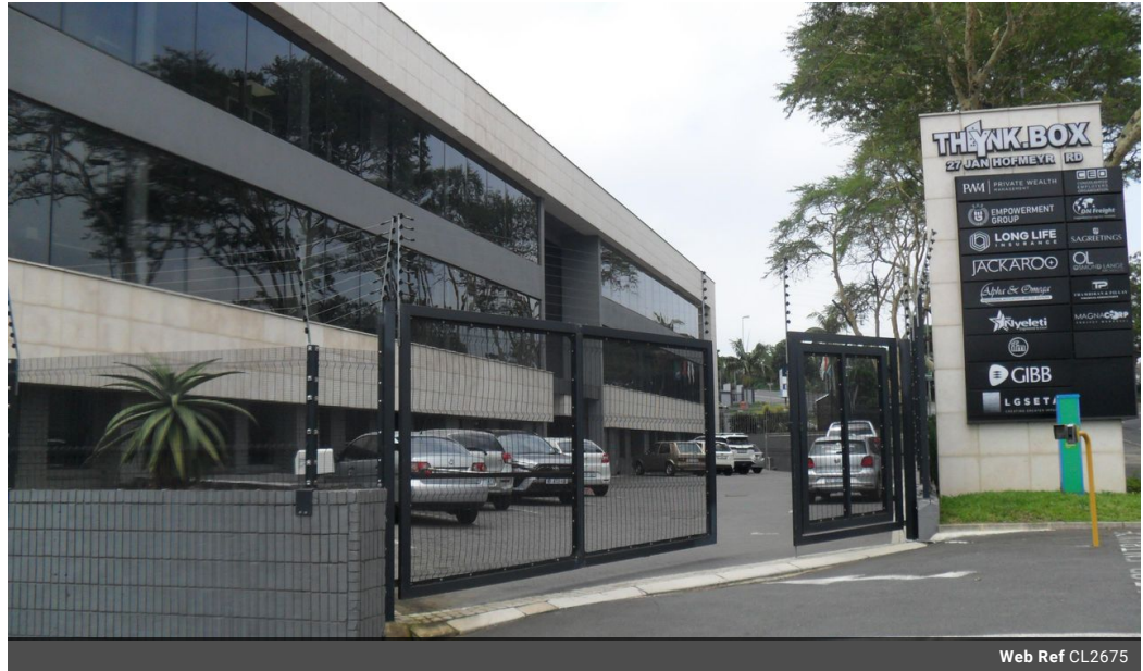
Web Ref CL2675

Block C Bellevue Campus 5 Bellevue Road Kloof