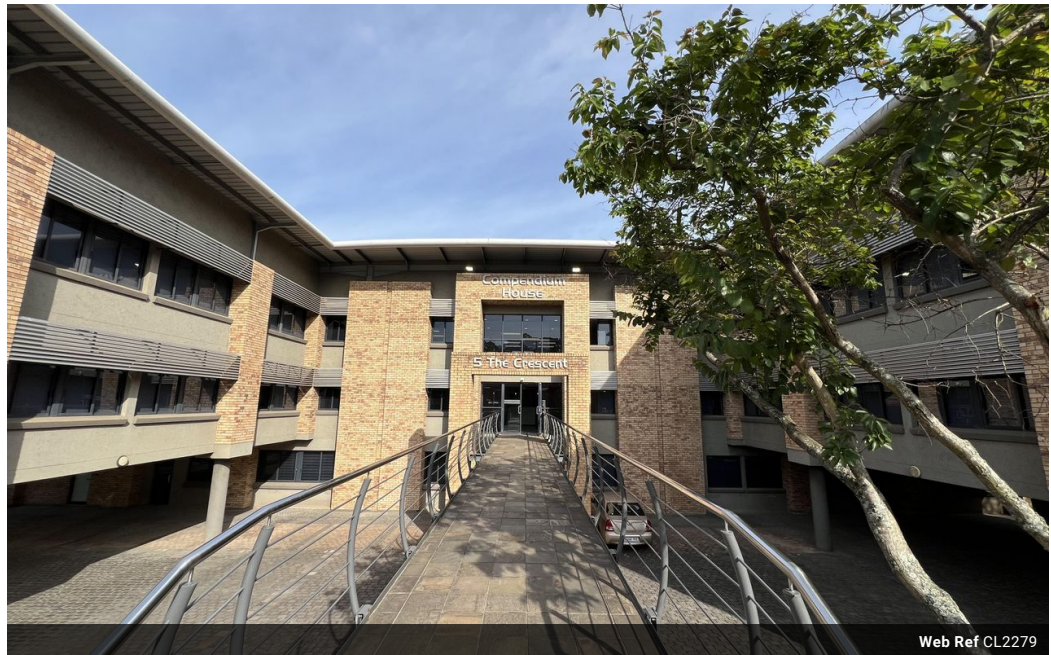
Web Ref CL2279

Block C Bellevue Campus 5 Bellevue Road Kloof