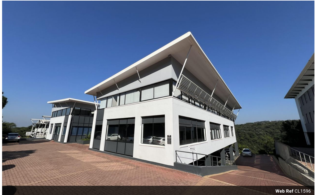
Web Ref CL1596

Block C Bellevue Campus 5 Bellevue Road Kloof