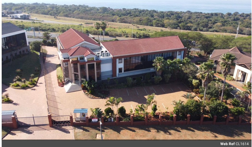
Web Ref CL1614

Block C Bellevue Campus 5 Bellevue Road Kloof