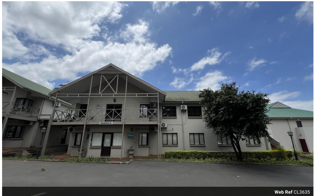
Web Ref CL3635

Block C Bellevue Campus 5 Bellevue Road Kloof