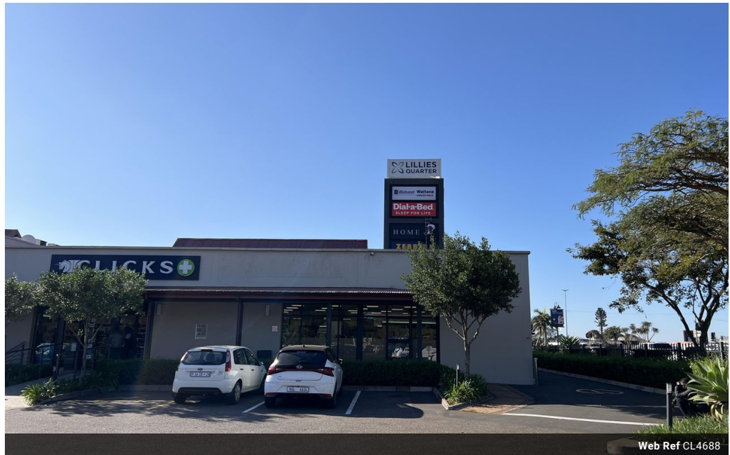
Web Ref CL4688

Block C Bellevue Campus 5 Bellevue Road Kloof