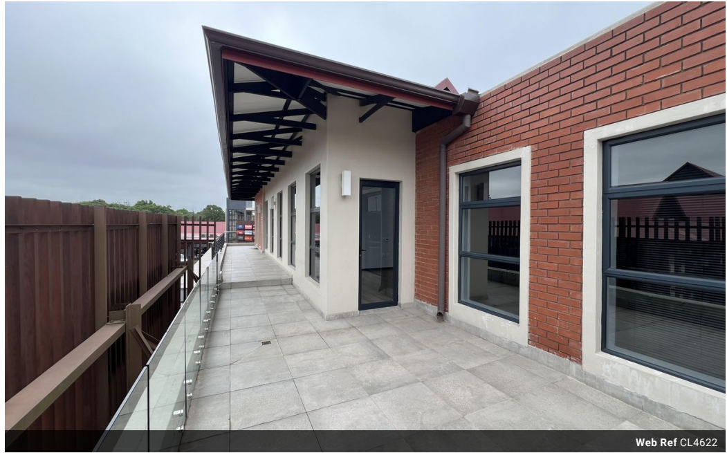
Web Ref CL4622

Block C Bellevue Campus 5 Bellevue Road Kloof