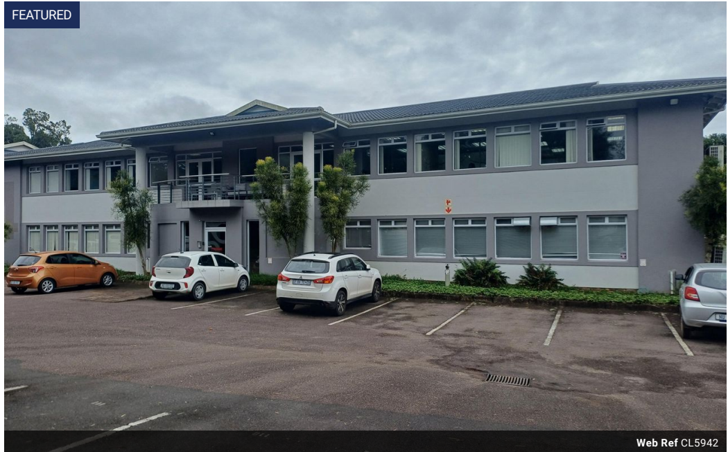
Web Ref CL5942