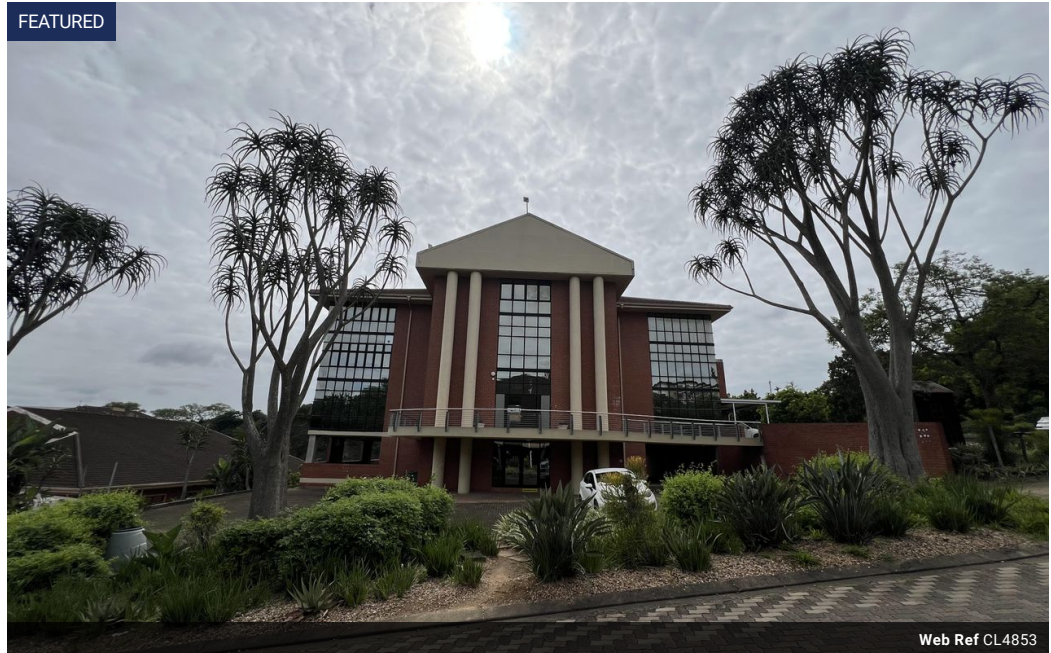
Web Ref CL4853