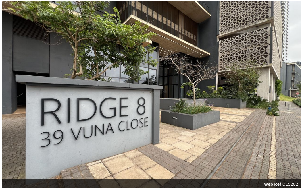
Web Ref CL5282

Block C Bellevue Campus 5 Bellevue Road Kloof