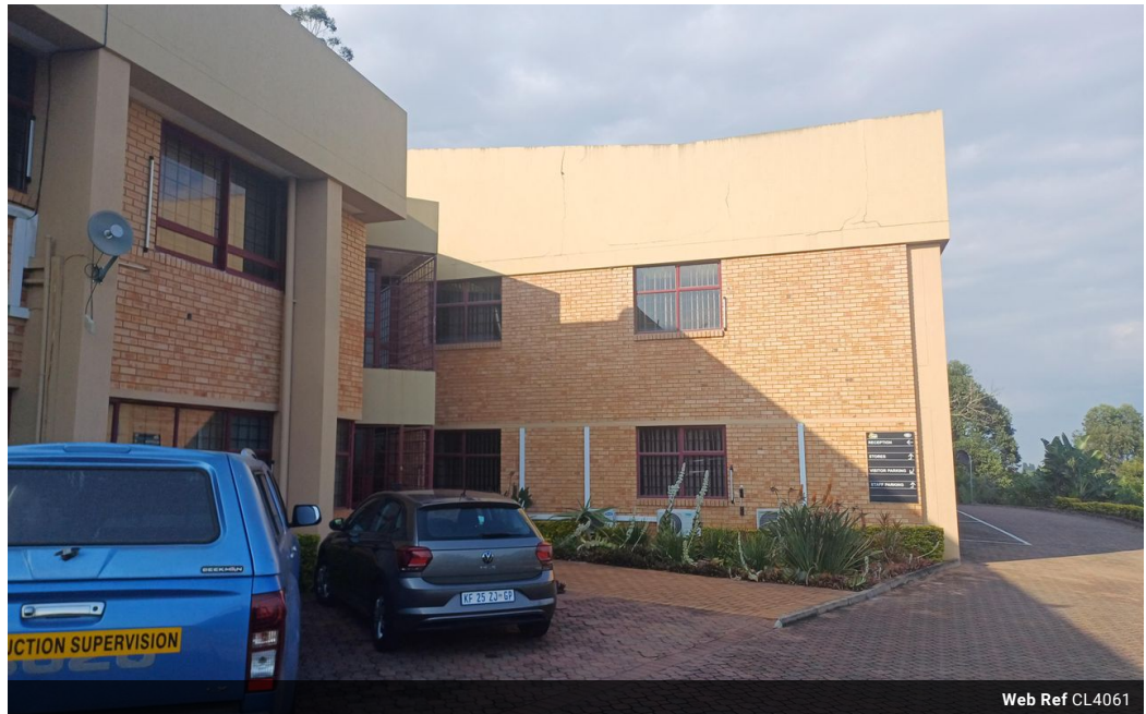
Web Ref CL4061

Block C Bellevue Campus 5 Bellevue Road Kloof