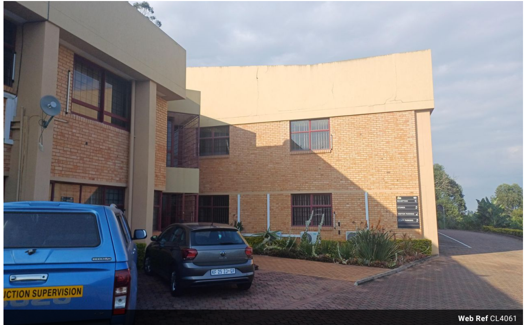
Web Ref CL4061

Block C Bellevue Campus 5 Bellevue Road Kloof