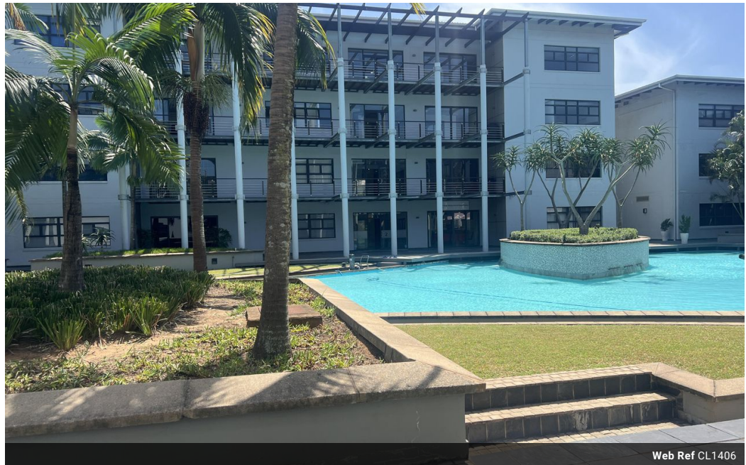
Web Ref CL1406

Block C Bellevue Campus 5 Bellevue Road Kloof